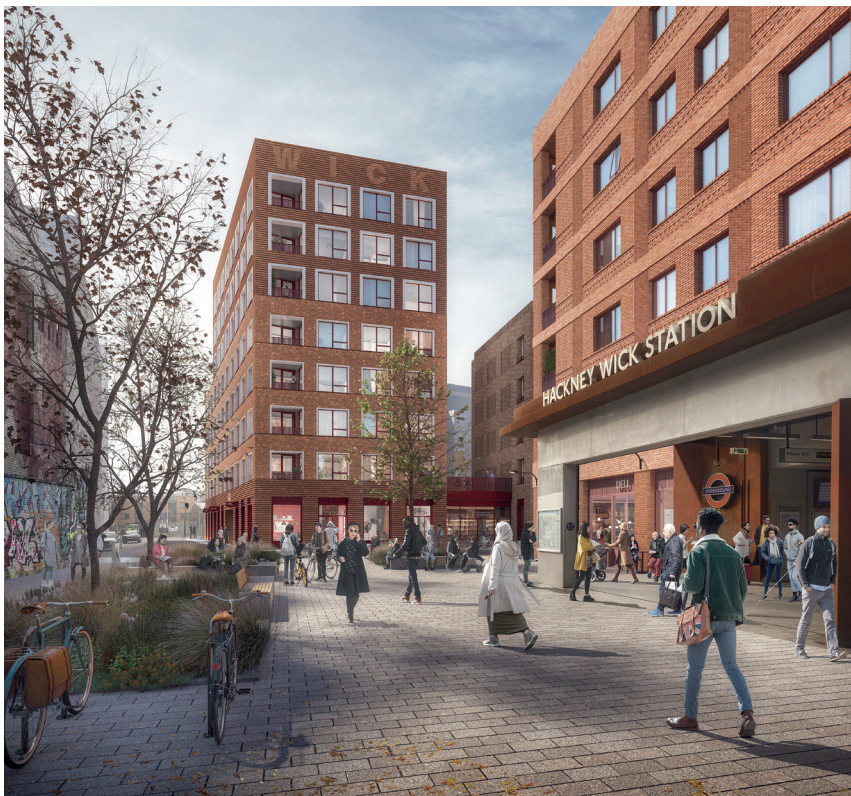
CGI is indicative only

Please let us know if you have any concerns. Contact details are on this newsletter and on the site hoardings.